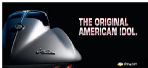
Chevrolet trademark(s) used with the written permission of General Motors.